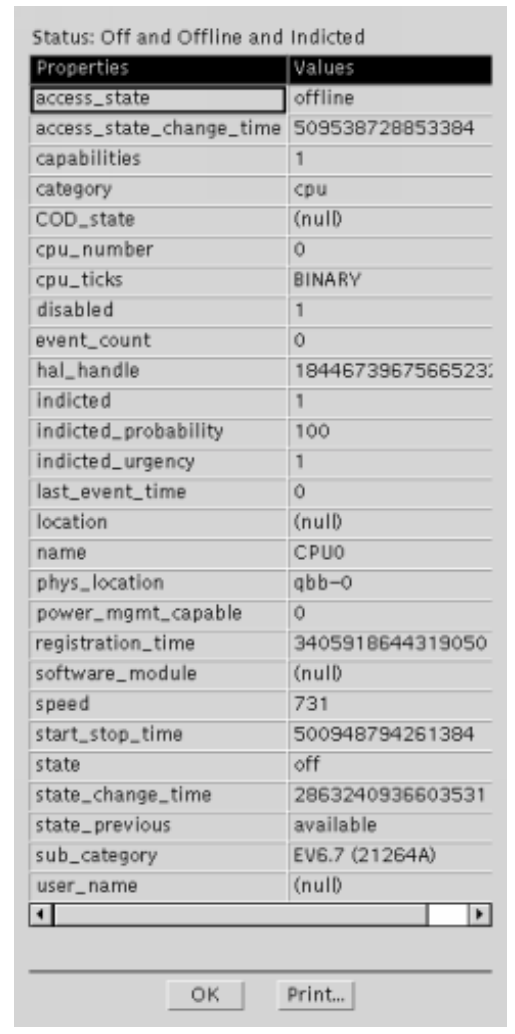
Figure 4-3: CPU Properties